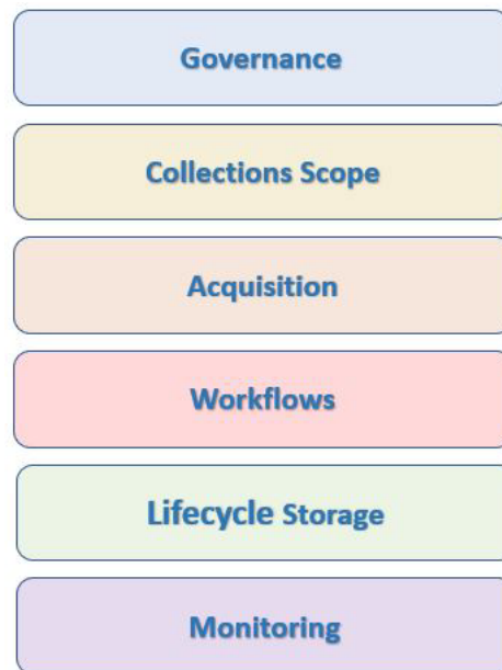
Figure 2. The DAP Framework layers

These six layers illustrate (Figure 2) the purpose and objectives of the core areas of activity to ensure long-term access to digital content that is managed by a repository.