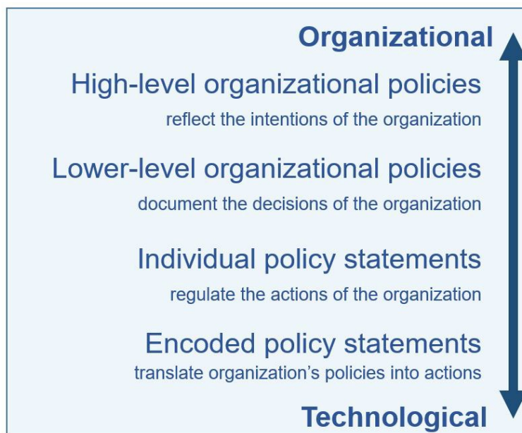
Figure 3. Human-Tool Continuum