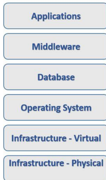
Figure 1. Common representation of an IT Stack

these technologies and long-term access to digital content relies upon an evolving array of technologies throughout its life. This reliance on technology can result in framing digital preservation as a technology-only problem. It is common and problematic for the related term infrastructure to be limited to mean only the technologies needed for digital practice rather than also to the organizational infrastructure including the human effort and wherewithal needed to continually evaluate, select, implement, support, and replace technologies. This technology focus led many digital preservation community discussions to include an inquiry about what “stack” an institution was using. For example, the Information Technology (IT) Stack (Figure 1) is often used to illustrate layers of technology.